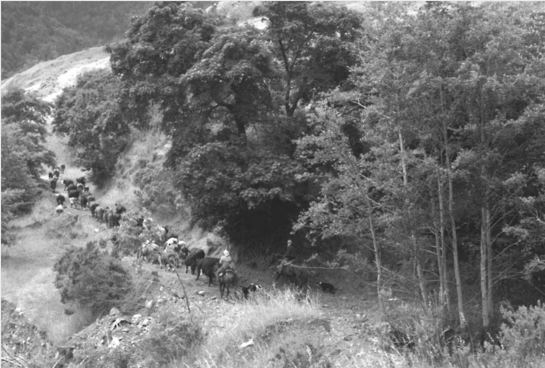
Trailing Cattle on the McWhorter's Peak Ranch near Petrolia

There are currently four vacant Board positions. The Buckeye Conservancy is evaluating several potential candidates, and will be sending letters of support for those candidates that demonstrate a commitment to protect working open space and the values of the Buckeye Conservancy.